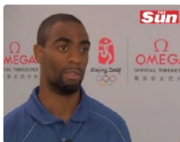
Omega Tyson Gay discusses Bolt's 100m race final The Sun, UK

The 2008 Beijing Olympic Games attracted intense global media attention for various reasons. Many global brands - sponsors and non-sponsors alike - wanted to leverage this attention to increase their mindshare in China and globally. thenewsmarket.com provided a customized portal that enabled brands and organizations to reach the media, consumers and bloggers before, during and after the Olympics.