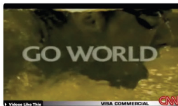
Visa VISA "Go World" Michael Phelps Ad CNN International

See Highlights of Olympic Content and Coverage Click to Play >>